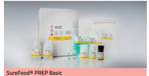
SureFood® PREP Basic