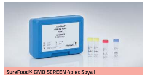
SureFood® GMO SCREEN 4plex Soya I