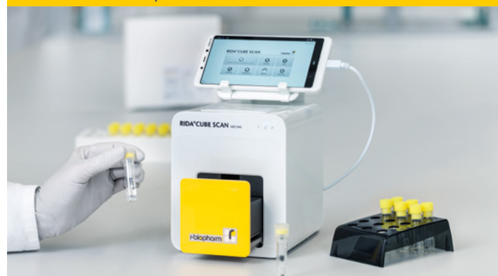
RIDA®CUBE SCAN, Art. No. ZRCS0546

Small and portable device (16 x 13 x 14.5 cm)