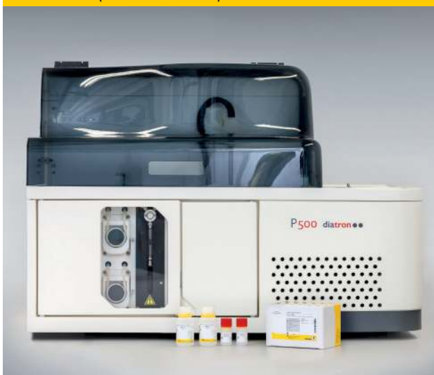
Pictus 500 (Art. No. ZP500)

Continuous loading of samples and reagents