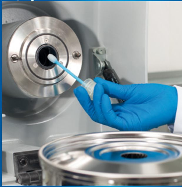
Sampling with Promedia ST-25

Use our rapid and reliable test systems to check raw materials, final products, production lines, staff and cleaning efficiency (CIP water) for microbial and allergen (cross-)contaminations.