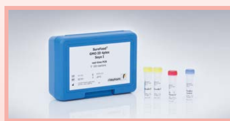
SureFood® GMO SCREEN 4plex Soya I

1 MON87708+CV127/DP305423/MON87701/MON87769