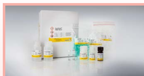
SureFood® PREP Basic